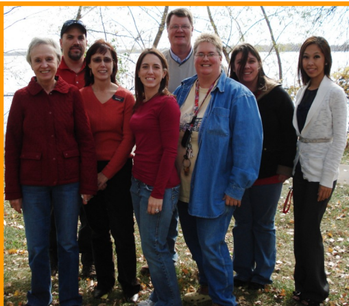
Lennar employees and Home Free staff at last year's Halloween activities.

Home Free received a $10,000 grant from the Lennar Foundation. This is the seventh year that we have received this important support.