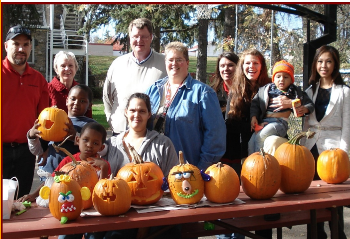
Lennar Family of Builders at Home Free for a Halloween event

* Golden Valley Federated Women's Club organized an event called "Pajama Party" where throughout the month of October, pajamas were collected for women and children living at Home Free.