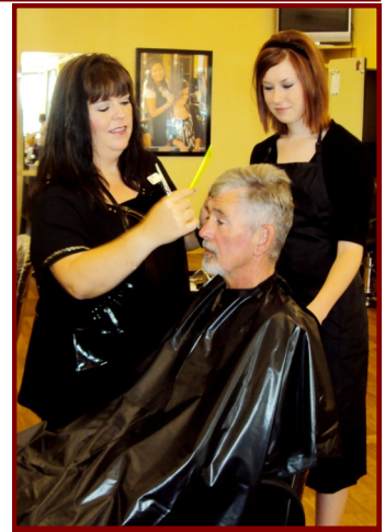
"Day of Beauty" at Empire Beauty School.